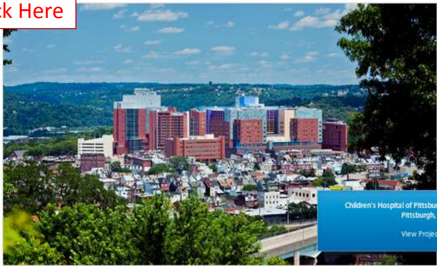
Children's Hospital of Pittsburgh Pittsburgh, PA View Project >